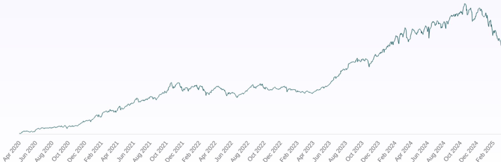
Balanced Multi Factor Model

Note: Live performance includes rebalances. It is a tool to communicate factual return information and should not be seen as advertisement or promotion.